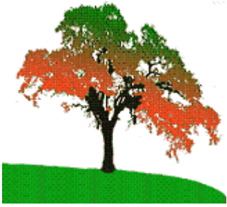
Strength in Later Life