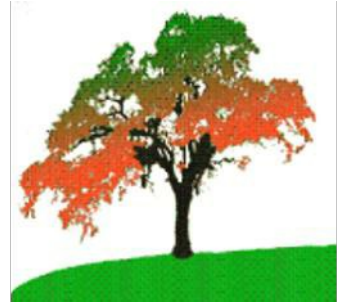
Strength in Later Life