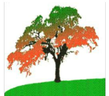
Strength in Later Life